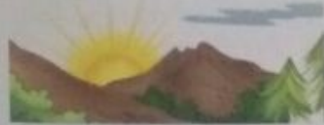
The sun is rising .

B Look at the picture and fill in the blanks with the suitable verbs from the box.