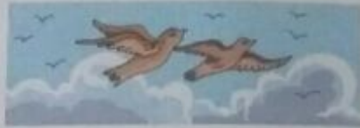
Birds are flying .