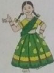
The girl is dancing .